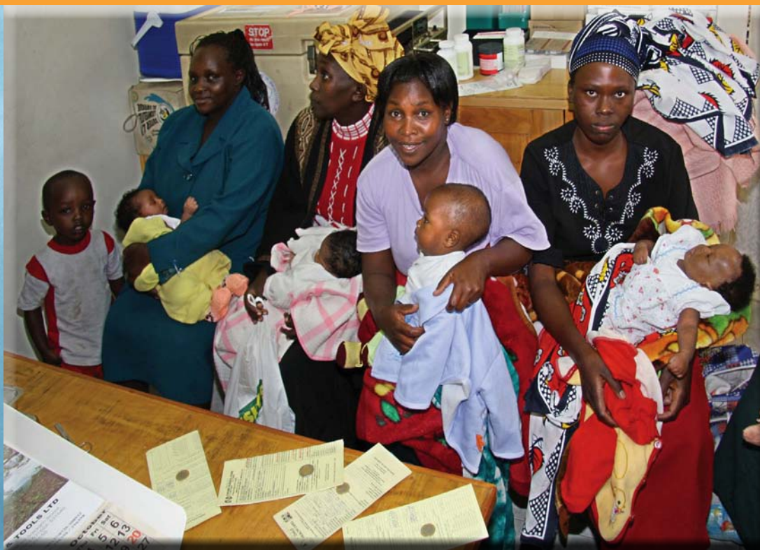
Mums and babies waiting for vaccinations at Ruben Medical Clinic

Contributing schools included Aquinas Perth, Aquinas Ringwood, Rostrevor, Adelaide, CBC Fremantle, CBC St Kilda, Parade Bundoora, St Bernard's Essendon, St Brendan-Shaw Devonport, St Joseph's, Gregory Terrace, St Patrick's, Launceston, St Laurence's, South Brisbane, St Edmund's Canberra,