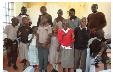
Children Singing, reopening Mary Rice Centre

In late 2010 the Mary Rice Centre, along with a number of other community agencies, unexpectedly lost its home when the Kenyan Government compulsorily acquired land for road construction and many dwellings and sites were bulldozed. This valued and important service, which supports vulnerable and disadvantaged children and young people with physical and intellectual disabilities from the Kibera slum, is now operating from a small local Catholic primary school and was reopened with great local community celebration on February 9. Ongoing funding is needed for the provision of programs and activities.