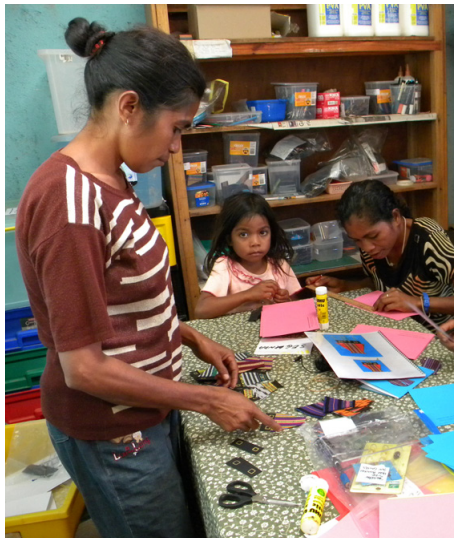
Card Making, Railaco Kraic, Timor Leste

A Coffee Tree Pruning Project to be undertaken in 2011 will provide farmers with expert on-site education by agriculturalists from the Coffee Cooperative Timor. Over the next two years an increase in coffee yield of approximately 30% is expected to result from proper pruning. Funds generated from the sale of JUST Coffee will be used to supplement the reduced income of the farmers whilst they participate in the pruning project.