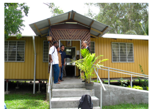
Callan Services National Unit, PNG