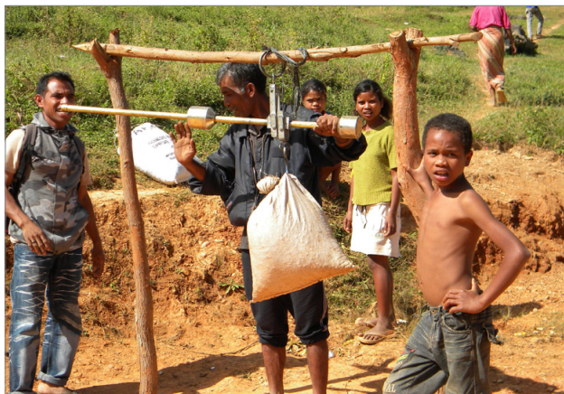
Weighing the coffee beans, Ermera District, Timor Leste

The coffee crops are family ventures which enable extra rice to be purchased for households, or to further educational opportunities for the children. JUST Coffee purchases enable you to support economic development within regional Timor Leste.