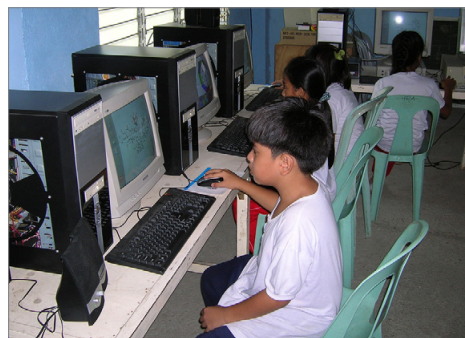
Learning the basics, Kabankalan, Philippines