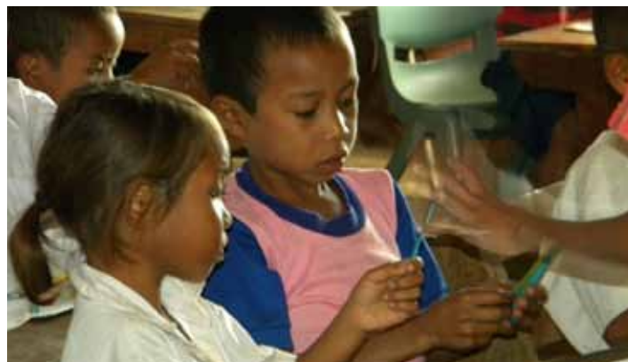
Learning to count, Timor Leste

Thank you to our many Australian donors, partner organisations and partner schools, who have made a difference to the lives of many people through the education, health and community development projects supported by the Foundation in developing nations during 2010