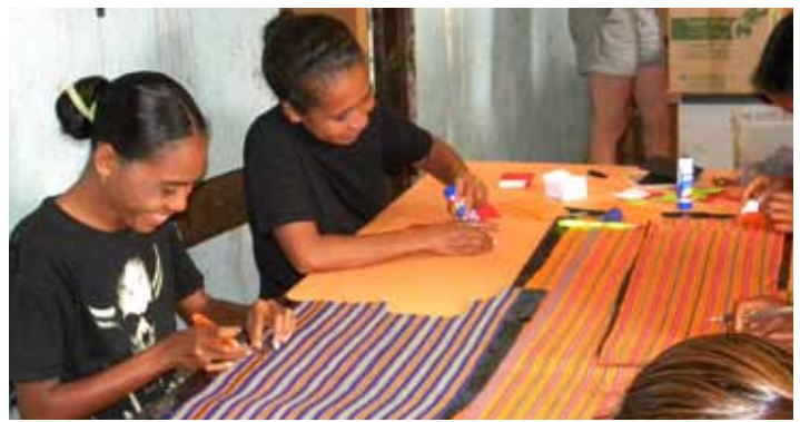
Art & Craft Co-operative, Railaco Kraic

CER also supports pre-school education. In 2011 this will involve 18 teachers at six sites operating three days a week, with all teachers participating in group training each Friday. Four of this group attended three week courses at ACU, Bacau, in Dili and received certificates at the end of 2010. An experienced pre-school teacher volunteer from Tasmania, who will be involved mainly in training local teachers, has been engaged for three months for 2011.