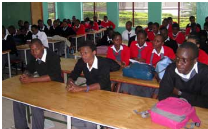
New Forms 5 & 6 Classroom, ERSSS

and priorities for 2011 include the ongoing development of local leadership.