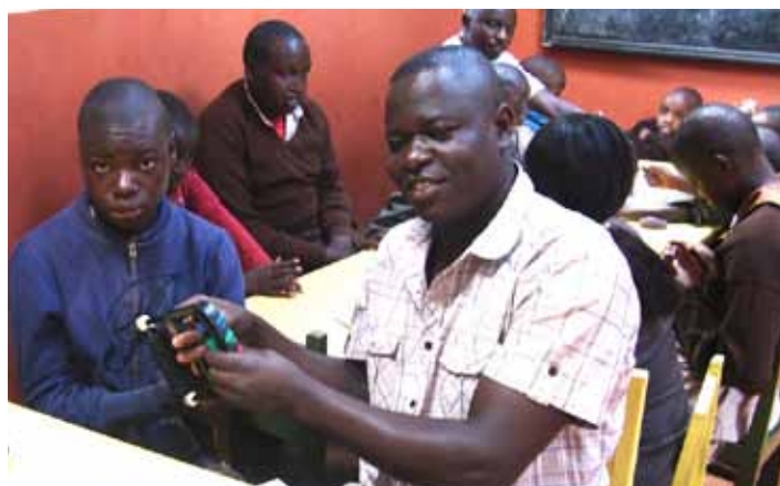
Hand Therapy, Mary Rice Centre

The Mary Rice Centre supports children with physical and intellectual disabilities in the Kibera slum. Assistance with the development of living and social skills builds confidence, independence and dignity. Educational, creative and recreational activities assist with transition to mainstream schooling and vocational training. MRC works with the local community to improve understanding of disability. Workshops help parents with the care of their disabled family member and parent networks enable mutual support. In late 2010, MRC's premises was unexpectedly, compulsorily acquired by the Kenya Government for major road construction. A considerable achievement has been the successful transition to accommodation in the St Charles Lwanga Primary School, which has great advantages in terms of integration. Ongoing capacity building for MRC staff is a particular focus for 2011.