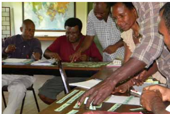
Team Work, Child Protection Training, CSNU Staff

In 2010, eight staff members from CSNU and two leaders from each of the Resource Centres participated in a National Conference, which identified a number of priorities: ongoing professional development opportunities for Centre staff, with particular reference to screening and testing and provision of assistance for teachers with the integration of children into mainstream schooling; updating of eye and ear screening equipment; improvement of resources to enhance the Resource Centres' own Centre based programs and increased availability of vehicles to enable access to more remote communities.