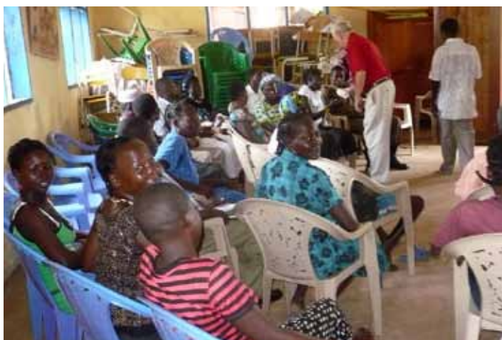
Waiting Area, STAR Centre, Yambio

STAR Support Group continues to be one of very few providers of services for people in Yambio area living with HIV/AIDS, a huge problem in the aftermath of the civil war and estimated to be about 15% of the population of Western Equatorial State. STAR has around 1300 program users and provides home based care, practical support and counselling for sufferers and families and community education to reduce infection rates and improve care. Following a review during 2010, a decision was taken to discontinue the specifically clinical/medical aspects of the STAR service and these will be phased out during 2011 and transferred to the Comboni Sisters Hospital in nearby Nzara. Following its many years of civil war, South Sudan has voted overwhelmingly for separation from the north. It is hoped that the new nation will at last provide conditions that will enable the local people to begin improving the quality of their lives.