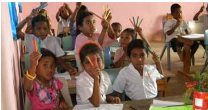
Primary Class, Railaco Kraic

Comunidade Edmund Rice (CER) supports health, education and development projects in partnership with local rural communities in the mountains behind Dili.