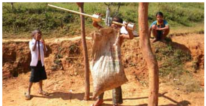
Weighing the Coffee Beans

A review of the operations of CER will be undertaken in June/ July 2011, with a view to maximising the impact of its work with the local people and ensuring the sustainability of its community development projects.