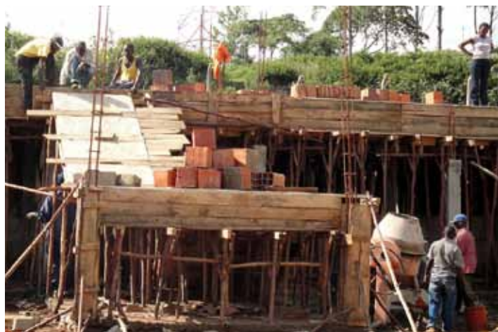
Construction Underway, New Primary School, BBCEC

BBCEC continues to provide educational opportunities for more than 800 primary and secondary students from the Embulbul area on the outskirts of Nairobi. 2010 saw commencement of construction of a new primary school block and six classrooms were completed to first floor level with all under pinning and structural works. It is intended that construction will be completed during 2011 along with an amenities building and associated water collection and drainage works. Kenya Certificate of Secondary Education results have continued to improve and the 2010 College Dux became the first BBCEC student to achieve an A grade in the KCSE. This is a significant milestone in the short history of the school, considering the first group of candidates sat for the KCSE only in 2007.