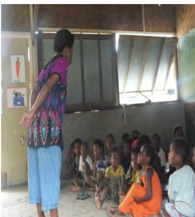
Inclusive teacher at Negri village

Negri is a village about 10 minutes drive from the main Yangoru Station in the Yangoru Sausia District. The village situated with a catholic mission parish and is being host to the early childhood project. The project is facilitated by Br Theo and the CBR staffs of the Wewak SERC.