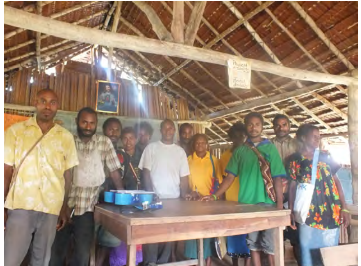
Photo: CBR volunteers at the Nerikum CBR center