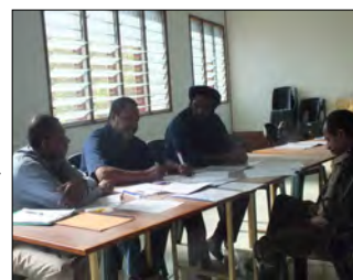
Board members discussing roles and responsibilities of BOG