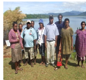
Mendi SERC staffs and volunteers at Lake Kutubu for ear and eye screening