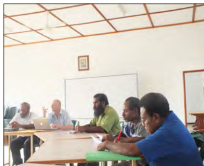
Board members attending board workshop, Emmaus Retreat Conference Room