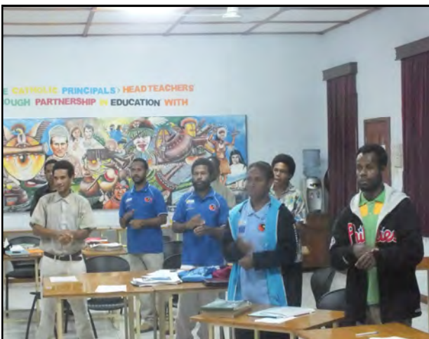
Photo: Sign Language Participants at the workshop

Callan Services for Disabled Persons runs a number of services for disabled Persons. One of them is the National