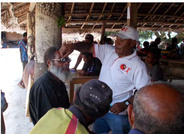
Photo: Jeff from Callan Optical conducting an eye check on a client at Finschafen during a visit from Callan Services